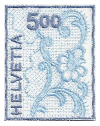
Fig. 6. The finished embroidery stamp as it was presented at NABA in St. Gallen, 21 June 2000.