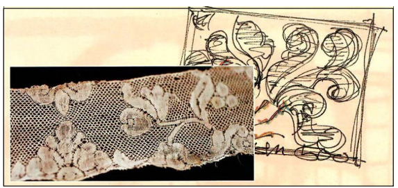
Fig. 1. Example of historic embroidery, ca 1760.

After further development of the design and selection of the final version, it was then prepared for industrial production (Fig. 4,5) and finally manufactured in various processes in Diepoldsau in the St. Gallen Rhein Valley.